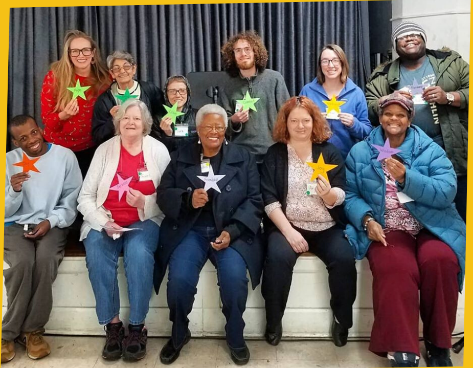
Holding our guiding Epiphany Stars for 2020